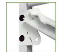
2HH-7532329 / 2HH-7532328 Angle Adaptor Plates