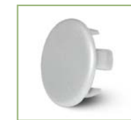
2HH-7532277 10mm Plastic Cover Cap