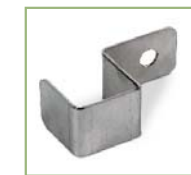
2HH-7532293 Wall Mounting Bracket