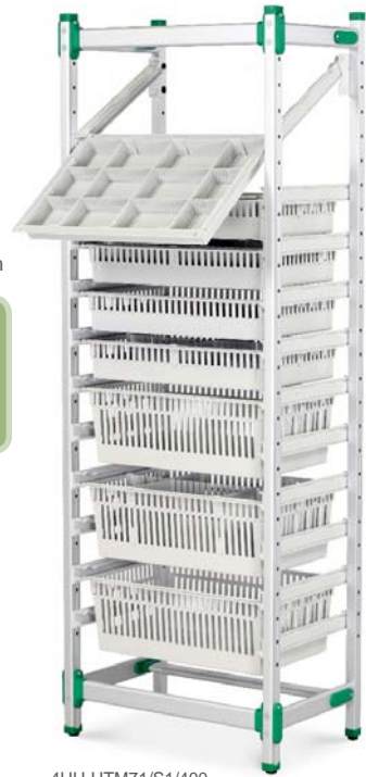
4HH-HTM71/S1/400 Runners, trays, baskets, dividers & angle brackets not included (order separately)