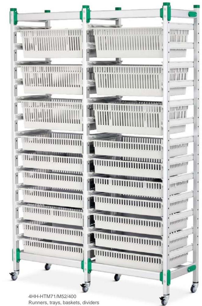
4HH-HTM71/M52/400 Runners, trays, baskets, dividers not included (order separately)