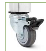
50mm Pressed Steel Castors