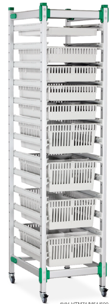
4HH-HTM71/M51/600 Runners, trays, baskets, dividers not included (order separately)